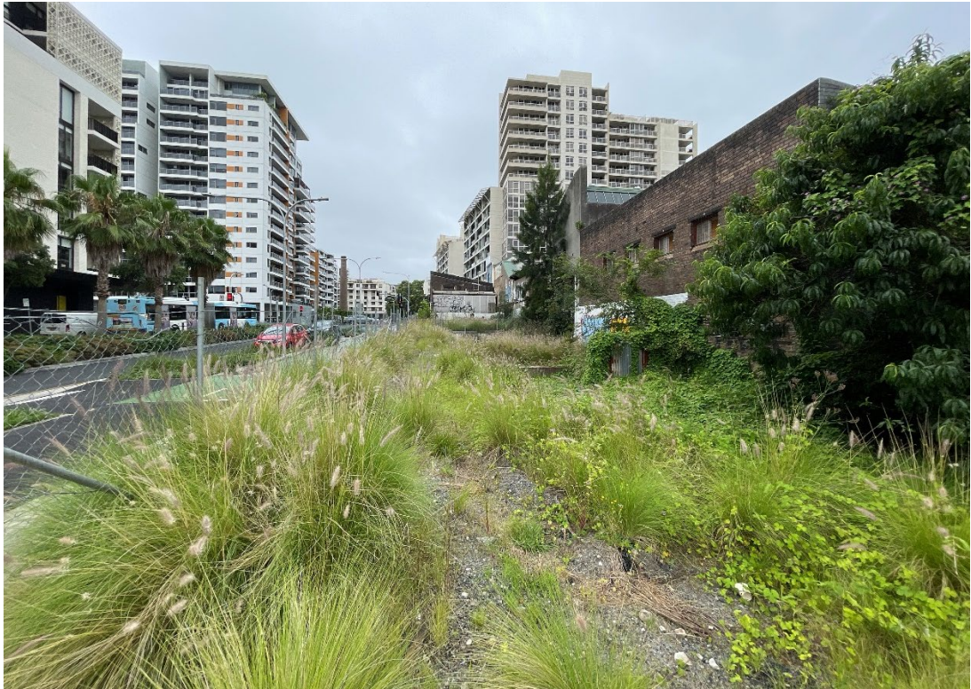
Proposed Lot 22 facing north from Murray Street with Gadigal Avenue to left