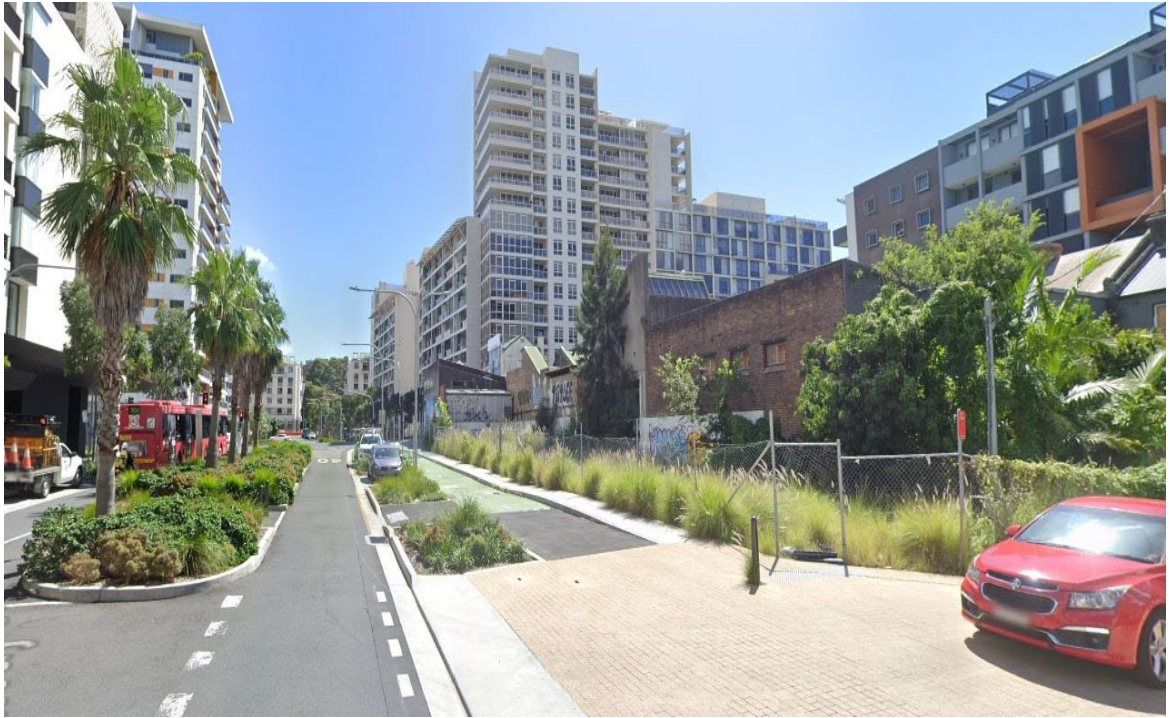
Looking north to Lachlan Avenue along Gadigal Avenue at junction with Murray Street