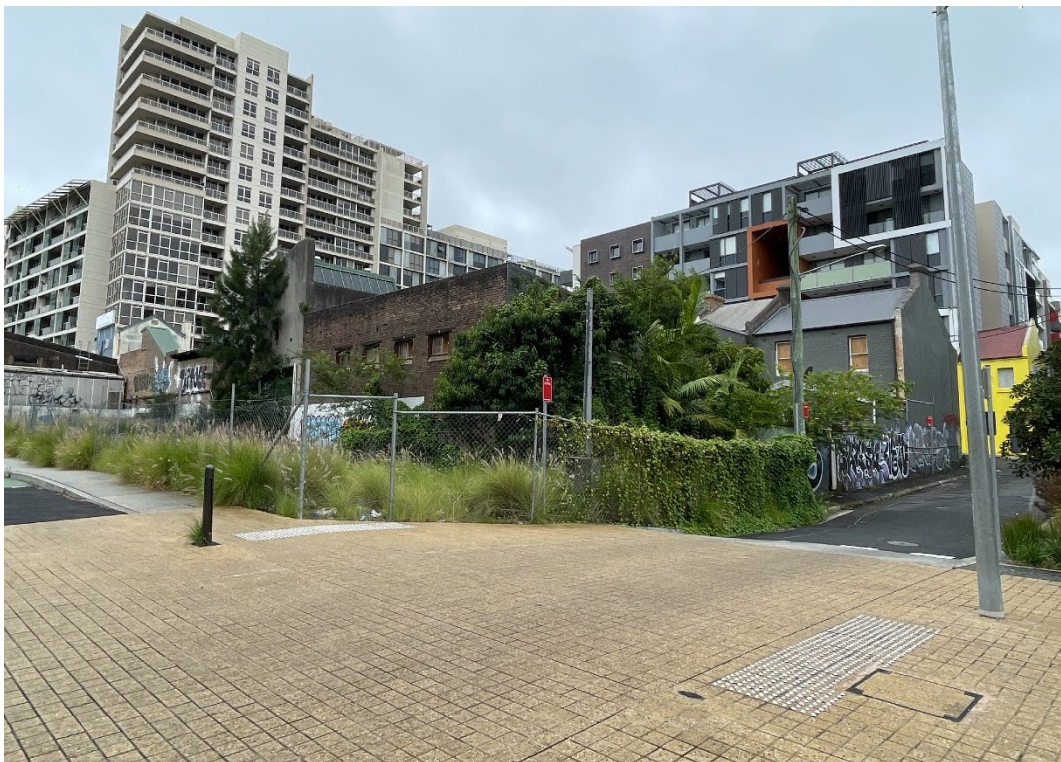
Proposed Lot 22 at corner of Murray Street and Gadigal Avenue Adjoining developer owned land in background